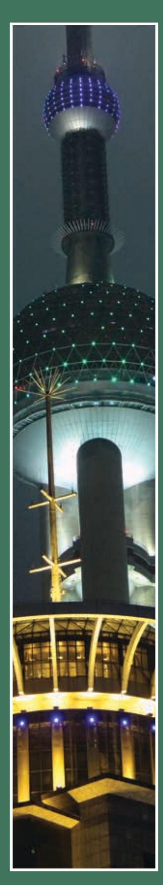
The Shanghai Oriental Pearl Tower, located at the tip of Lujiazui in the Pudong district.