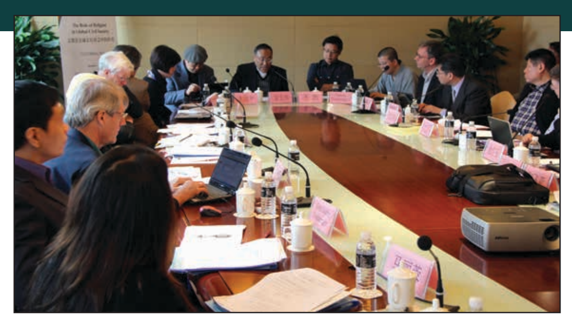
Participants at the Shanghai workshop on The Role of Religion in Global Civil Society.