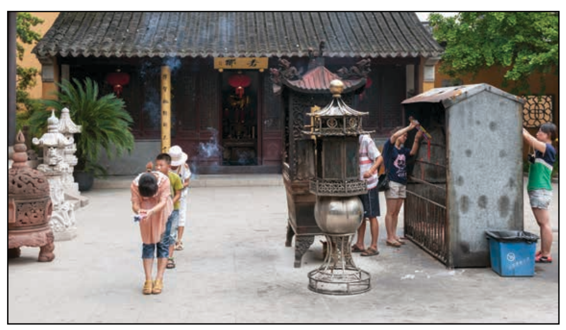
Chinese praying at a monastery in Zhouzhuang, China.