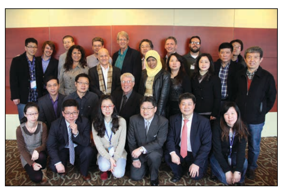
Participants and staff of the Shanghai workshop on The Role of Religion in Global Civil Society.