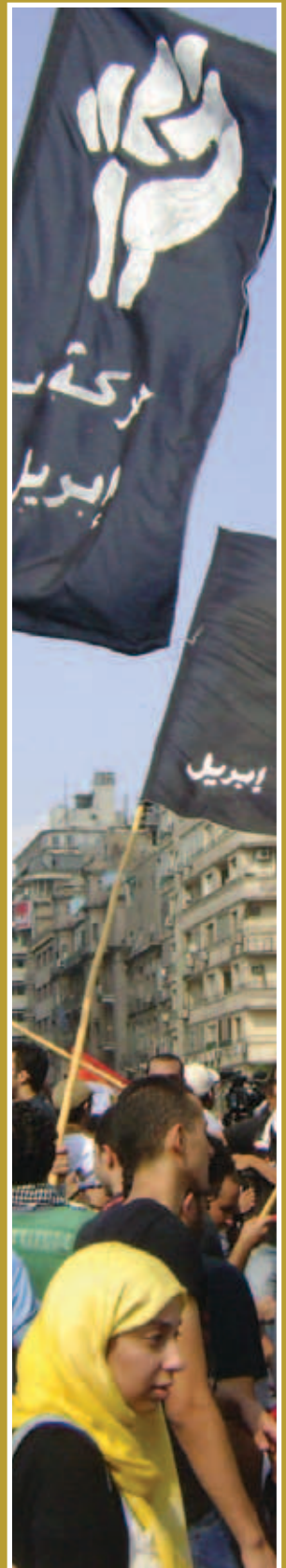
Pro-democracy demonstrators in Tahrir Square.