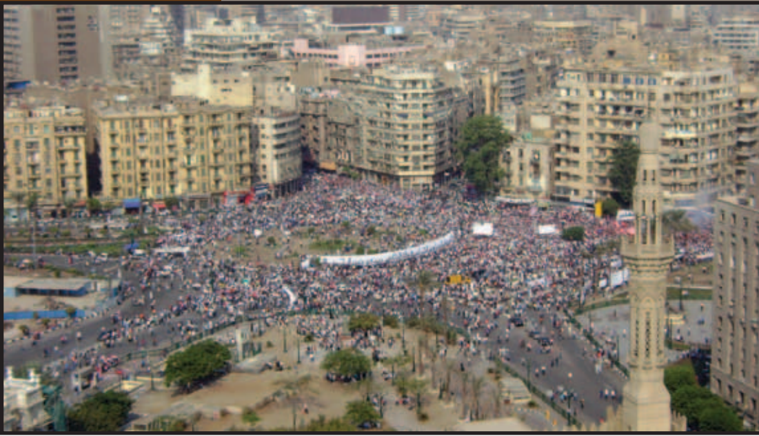
Pro-democracy demonstrators unite in Tahrir Square.