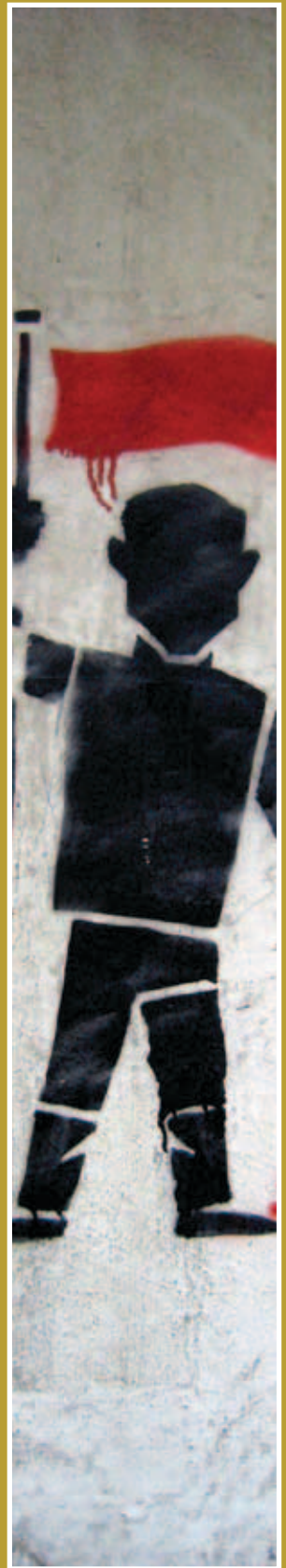
Pro-democracy graffiti on a wall in downtown Cairo.