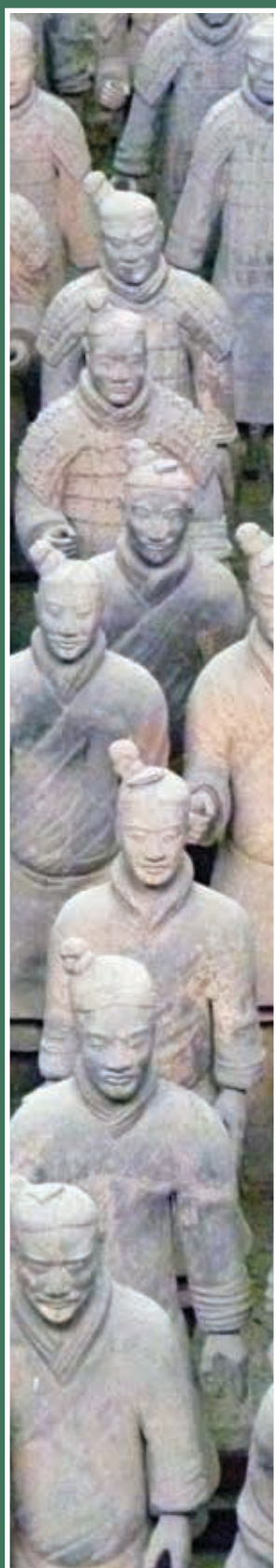
Soldiers from the terracotta army unearthed from the mausoleum of Qin Shi Huang, the first emperor of China.