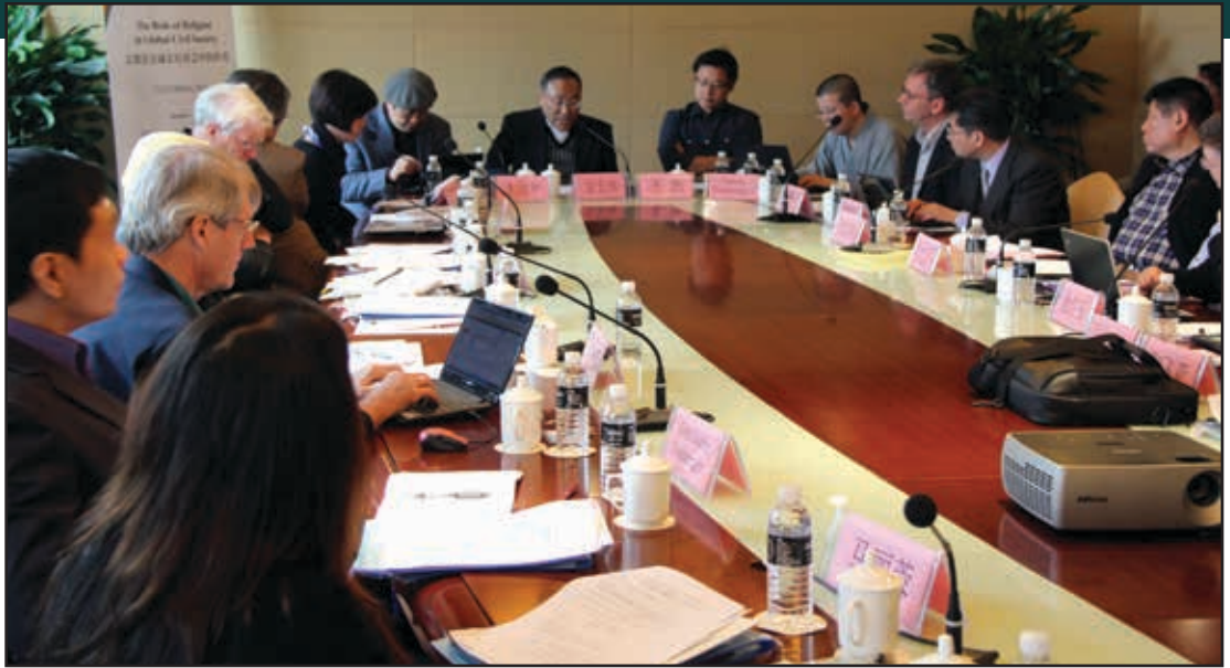
Participants at the Shanghai workshop on The Role of Religion in Global Civil Society.

Religion should be playing the role to harmonize and also to build up relations in three main areas.