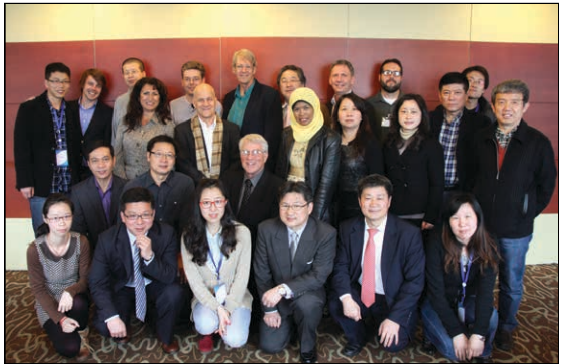
Participants and staff of the Shanghai workshop on The Role of Religion in Global Civil Society.