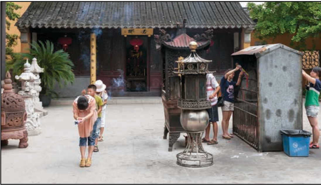
Chinese praying at a monastery in Zhouzhuang, China.