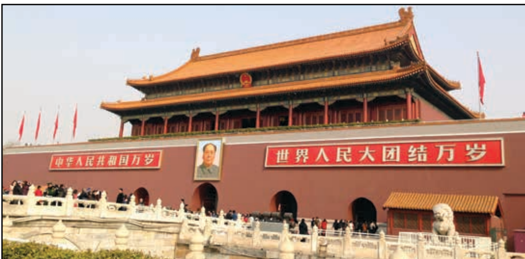
Portrait of Chairman Mao greets visitors at the entrance to the Forbidden City.