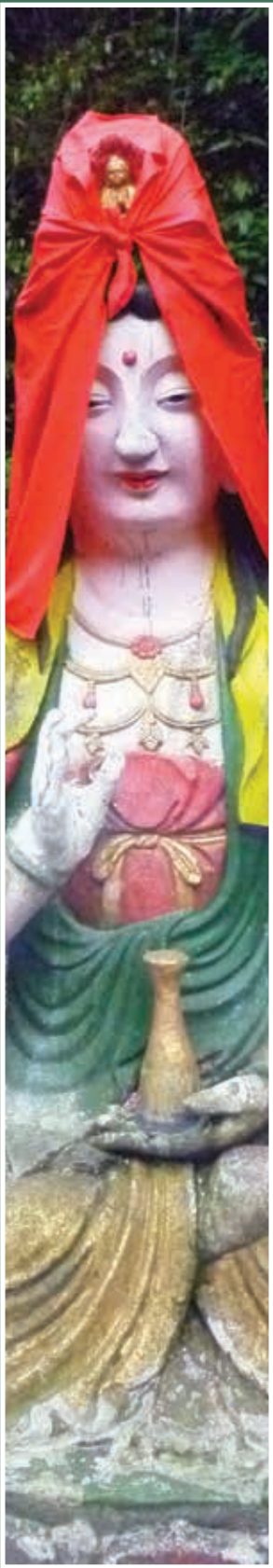
Goddess bestowing blessings on pilgrims along the path to the sacred temple atop Qingchen Mountain.